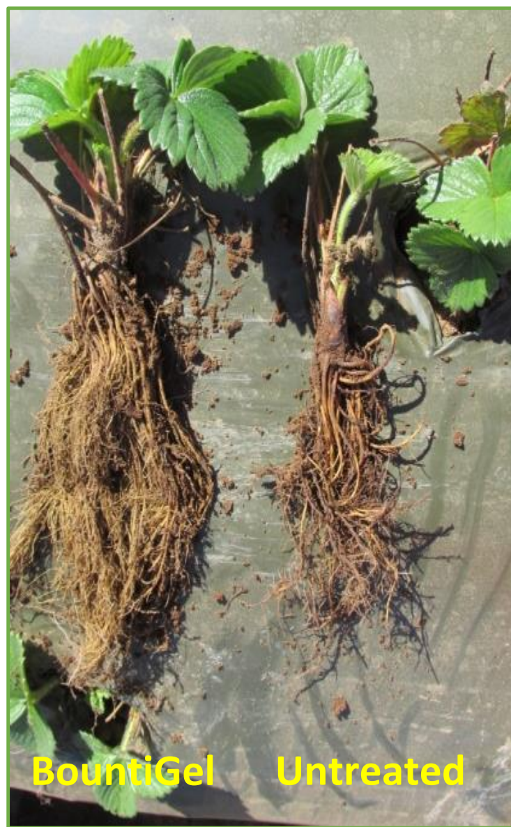
Average Weight/Sampled Plot